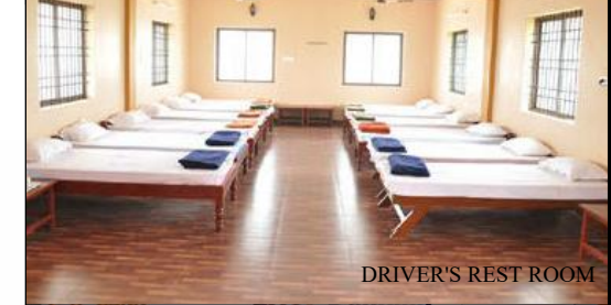
DRIVER'S REST ROOM