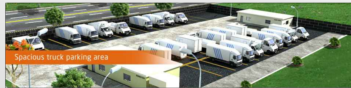
Spacious truck parking area