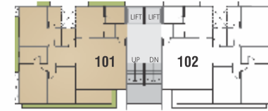
BLOCK A & C