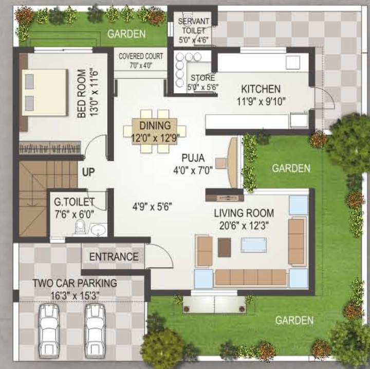
▲ GROUND FLOOR