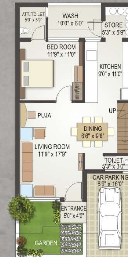
▲ GROUND FLOOR