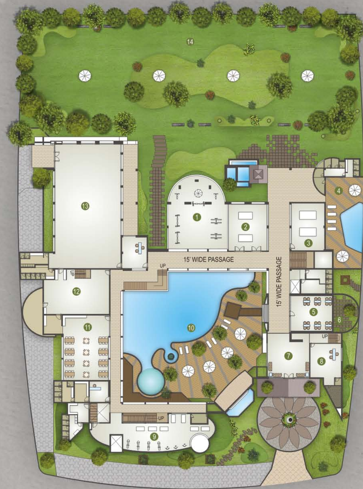
▲ GROUND FLOOR