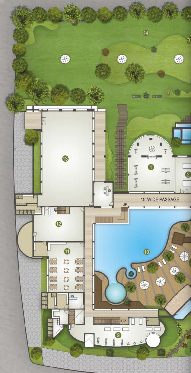
▲ GROUND FLOOR