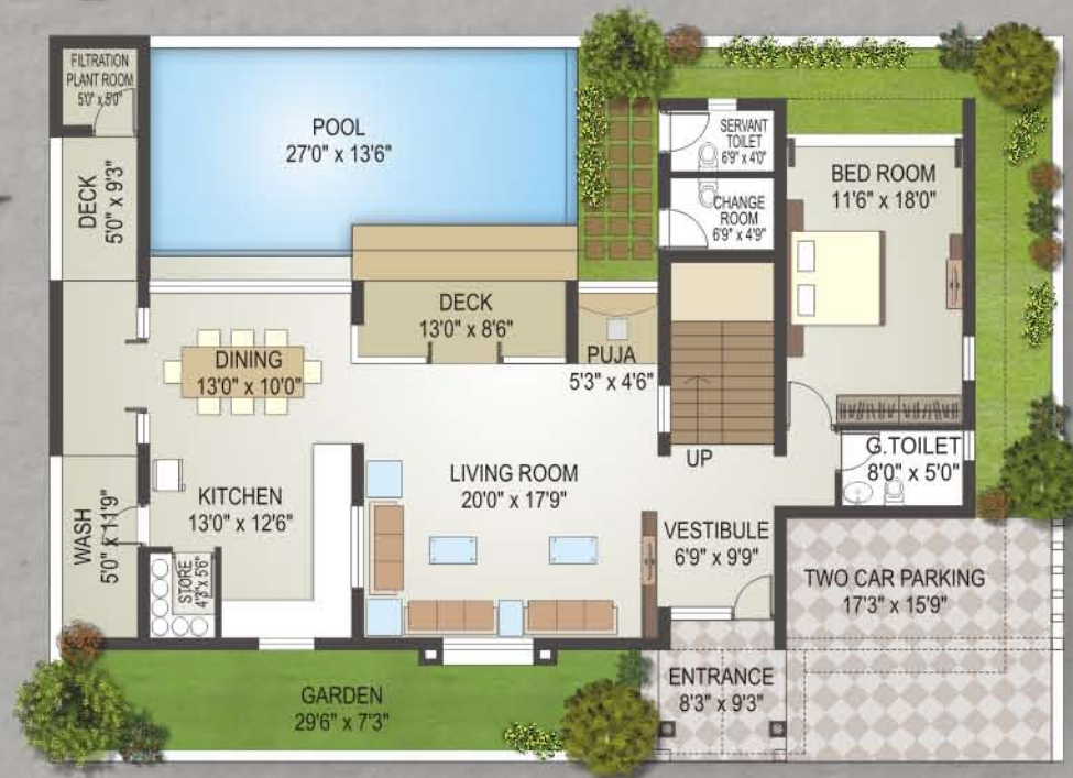
▲ GROUND FLOOR