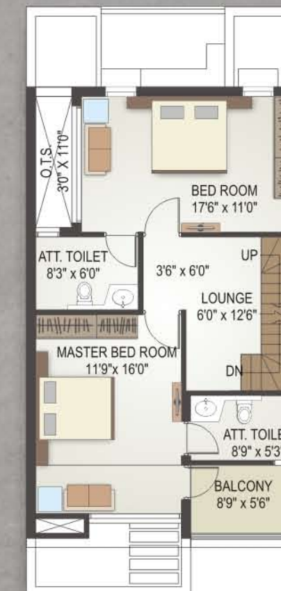
▲ FIRST FLOOR