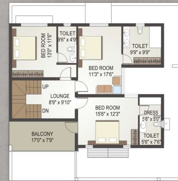
▲ FIRST FLOOR