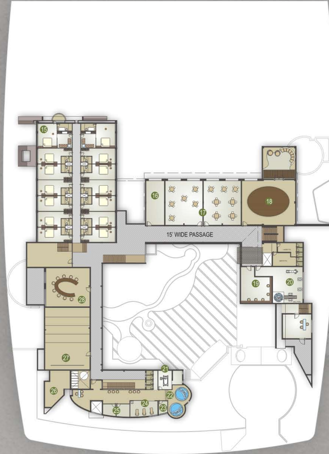
▲ FIRST FLOOR