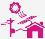
Solar On-Grid System