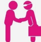
Solar Business Partners

Preferred & Trusted By 2500+ Customers Globally