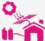
Solar Off-Grid System