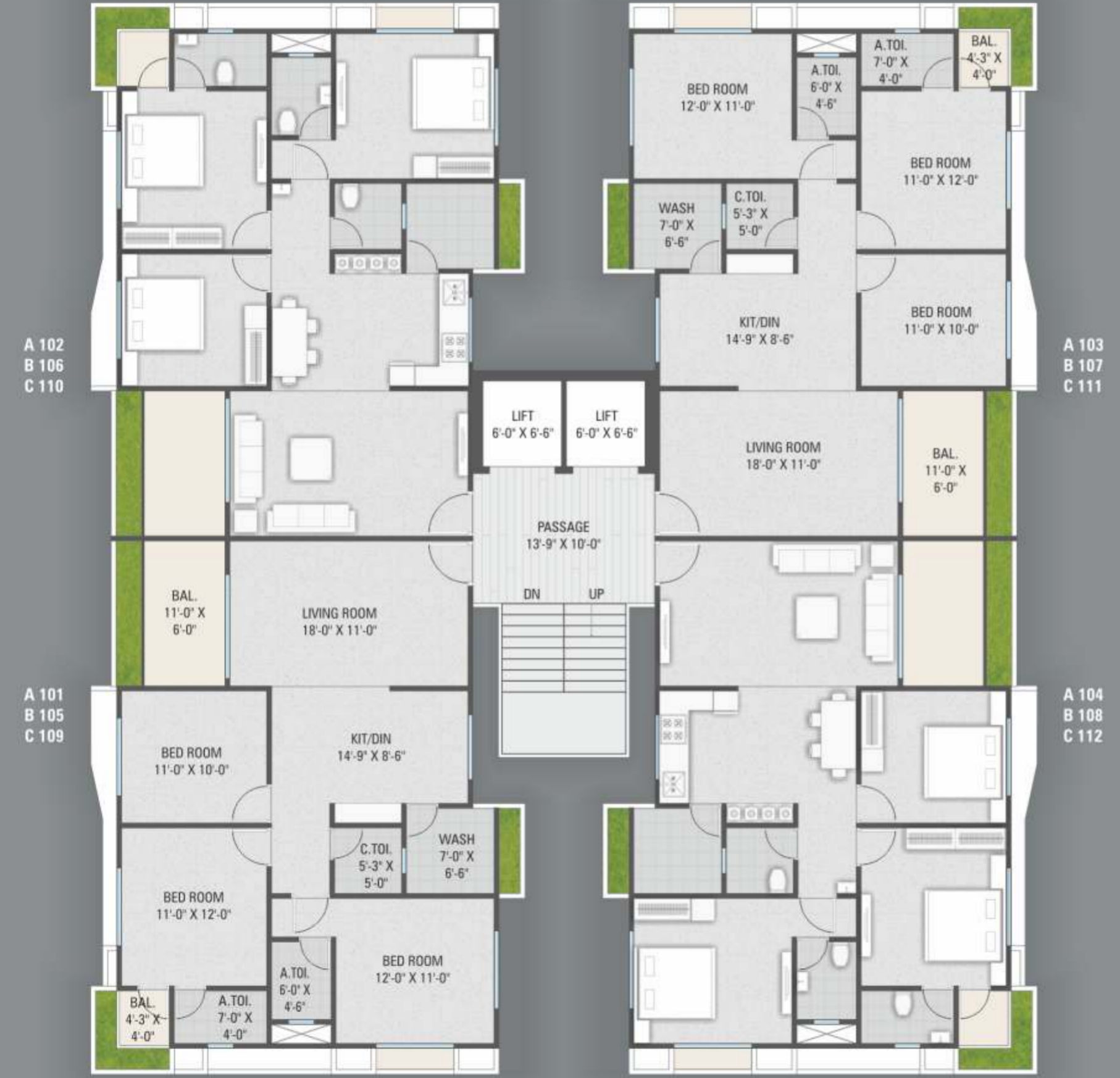
( TYPE - A,B,C - 3 BHK )