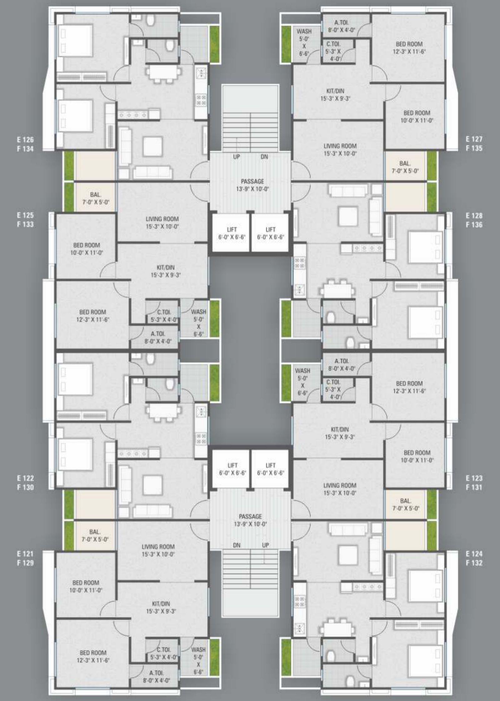
( TYPE - E,F - 2 BHK )