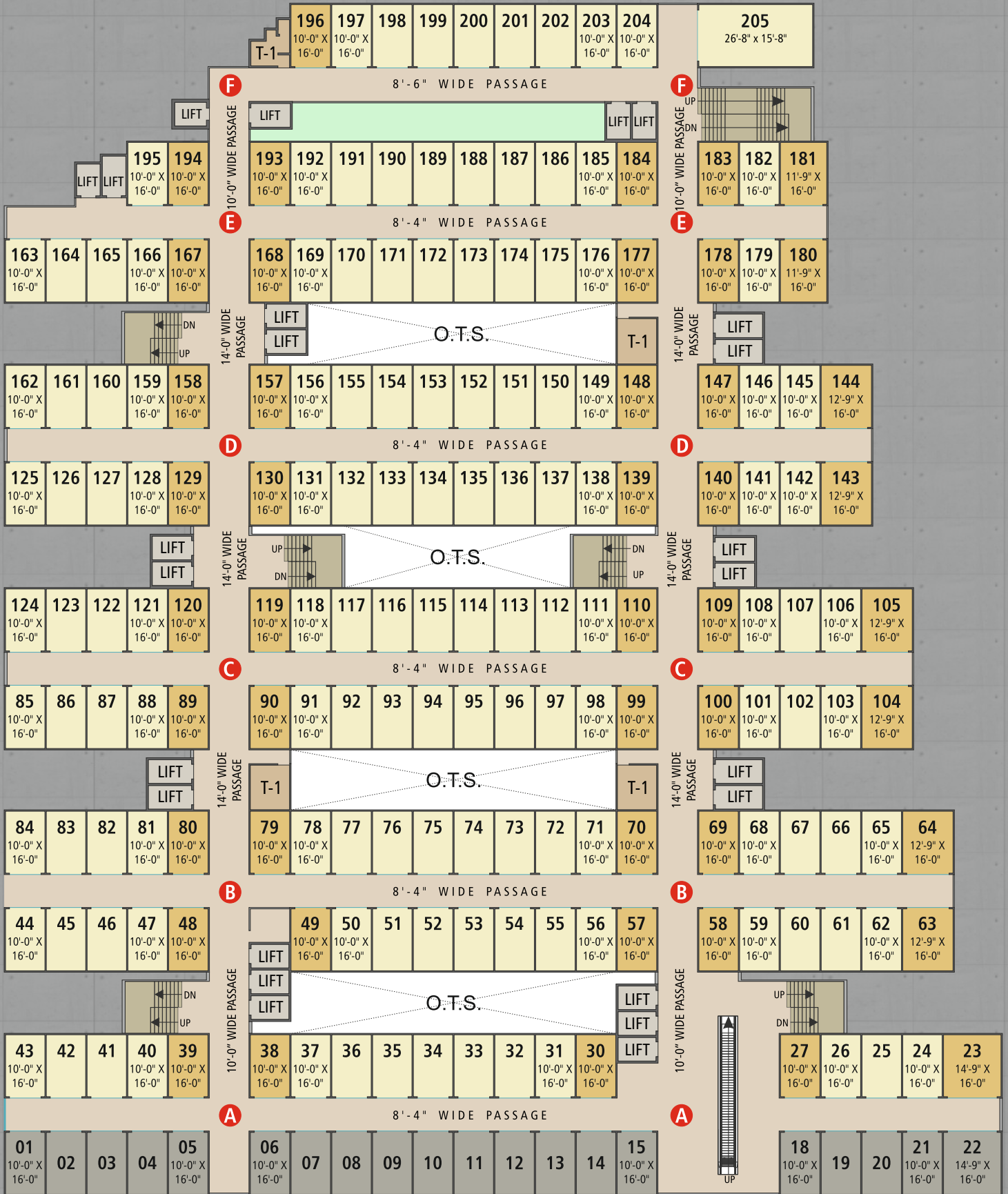
N *TYPICAL FLOOR PLAN