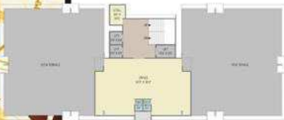
7th FLOOR PLAN