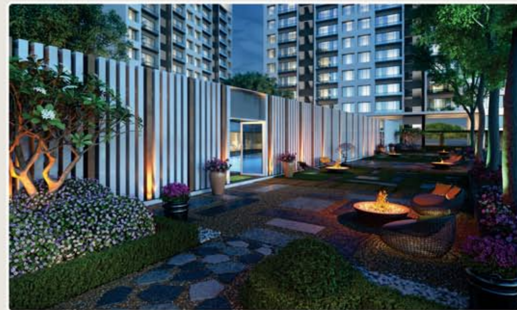
Swimming Pool Entry