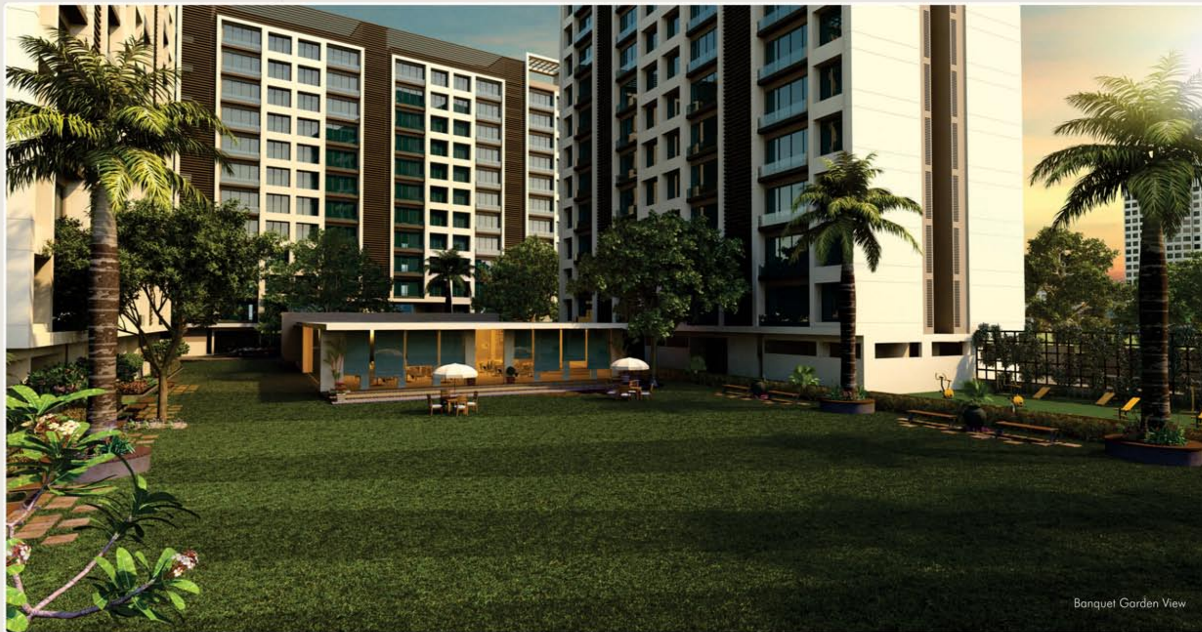
Banquet Garden View

Avadh - COPPER STONE, gives you privileged access to a world of leisure and entertainment that is nothing less than spectacular. You enter a beautifully landscaped environment, with reflecting pools, lush garden and serene expanses of green. An elegant party venue, with its own lawn helps you celebrate special occasions in style.