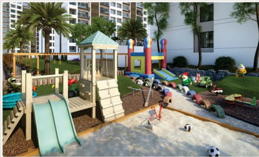
Children Play Area