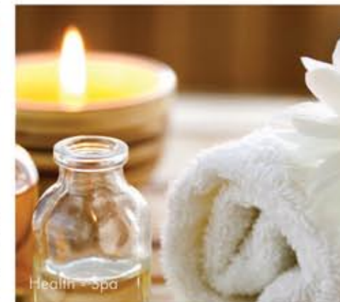
Health + Spa