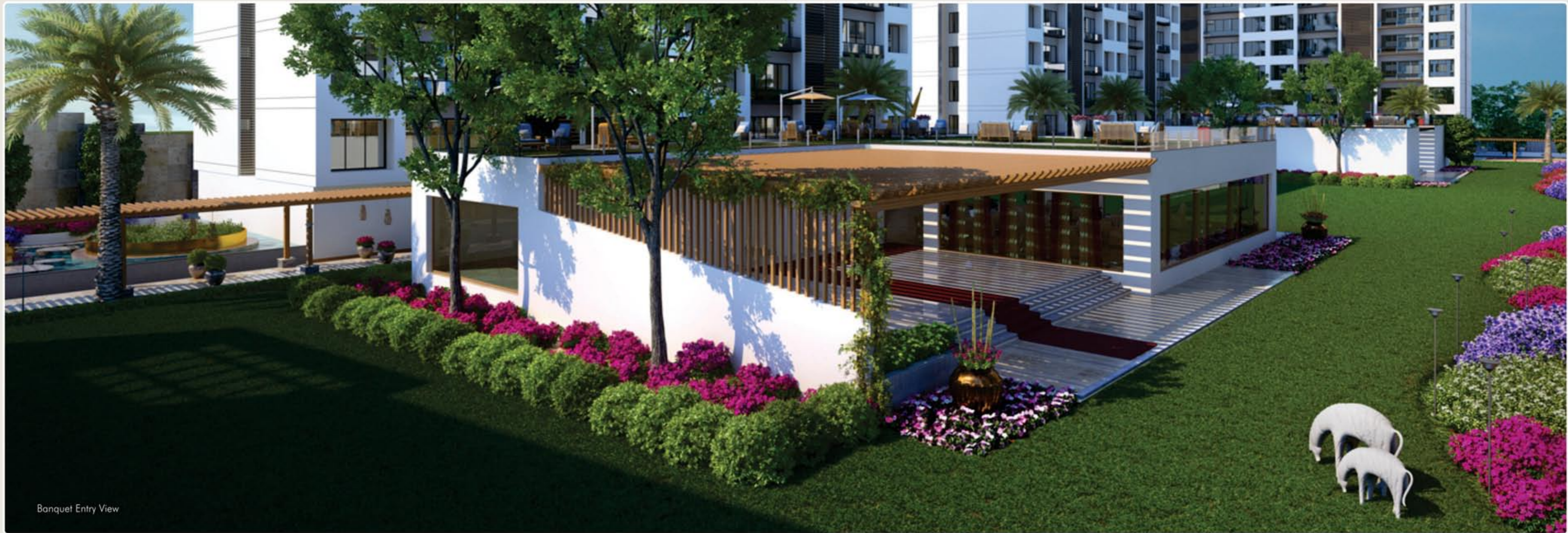
Banquet Entry View