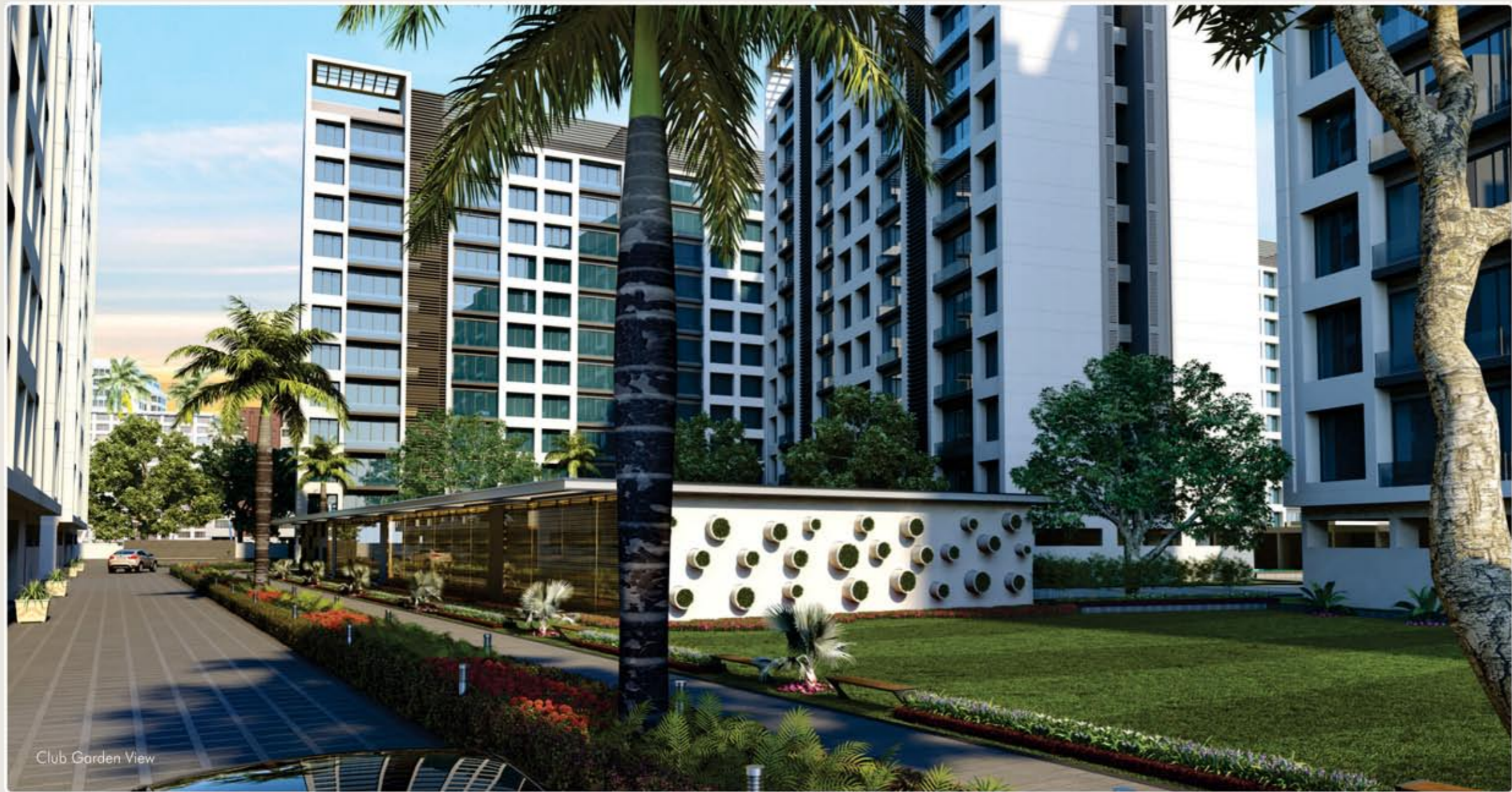
Club Garden View