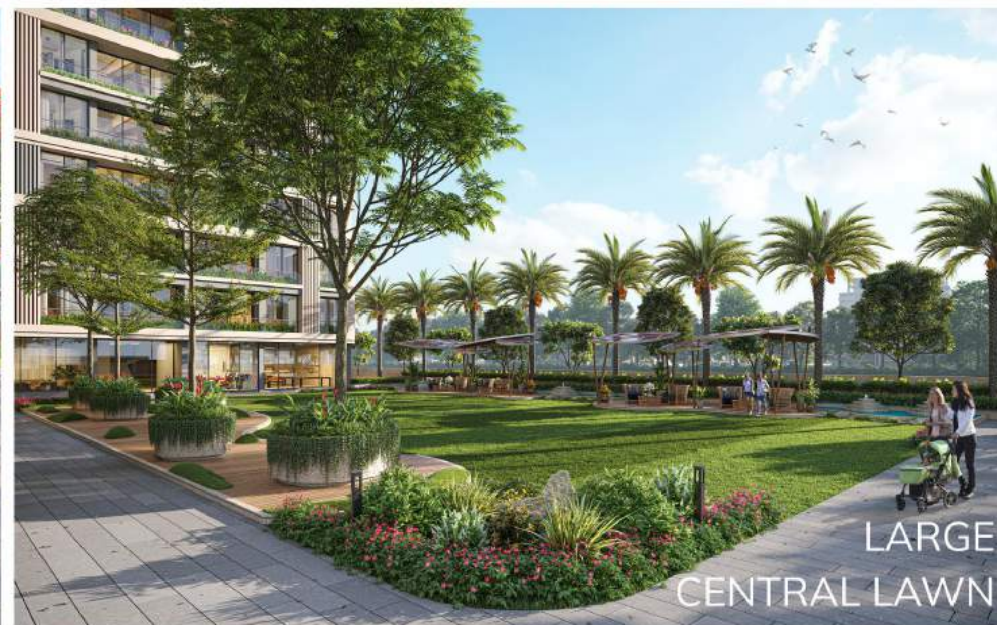
LARGE CENTRAL LAWN