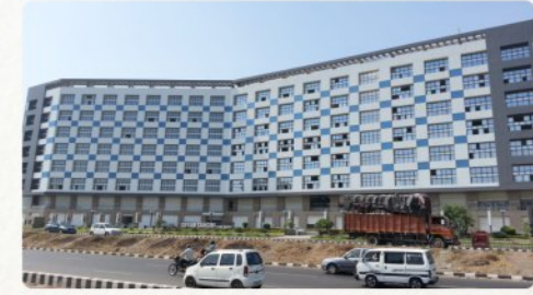
SHYAM SANGINI TEXTILE MARKET-1