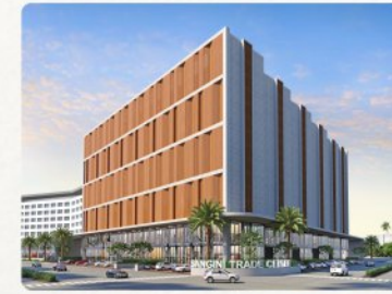
SANGINI TRADE CENTER