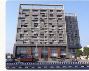
SANGINI TEXTILE HUB -A