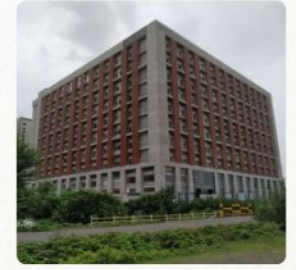
SANGINI TEXTILE HUB -B